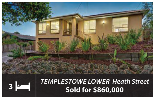
3 TEMPLESTOWE LOWER Heath Street Sold for $860,000