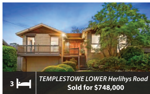
3 TEMPLESTOWE LOWER Herlihys Road Sold for $748,000