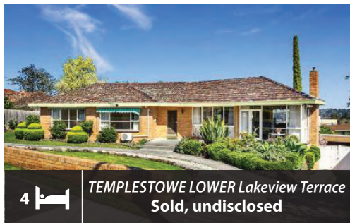
4 TEMPLESTOWE LOWER Lakeview Terrace Sold, undisclosed