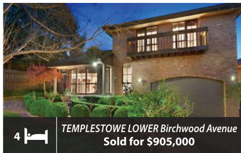
4 TEMPLESTOWE LOWER Birchwood Avenue Sold for $905,000