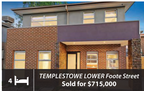
4 TEMPLESTOWE LOWER Foote Street Sold for $715,000