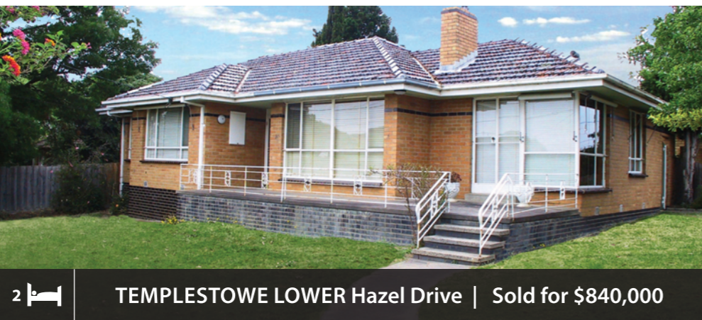
2 TEMPLESTOWE LOWER Hazel Drive | Sold for $840,000