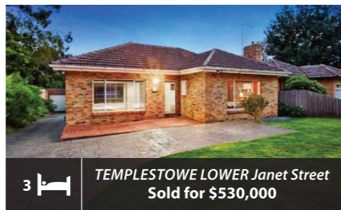
3 TEMPLESTOWE LOWER Janet Street Sold for $530,000