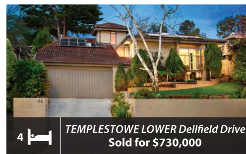
4 TEMPLESTOWE LOWER Dellfield Drive Sold for $730,000