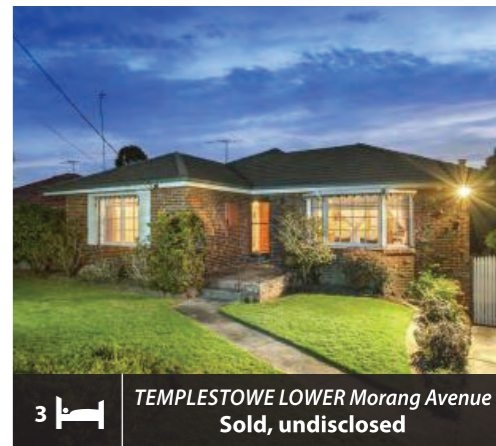
3 TEMPLESTOWE LOWER Morang Avenue Sold, undisclosed