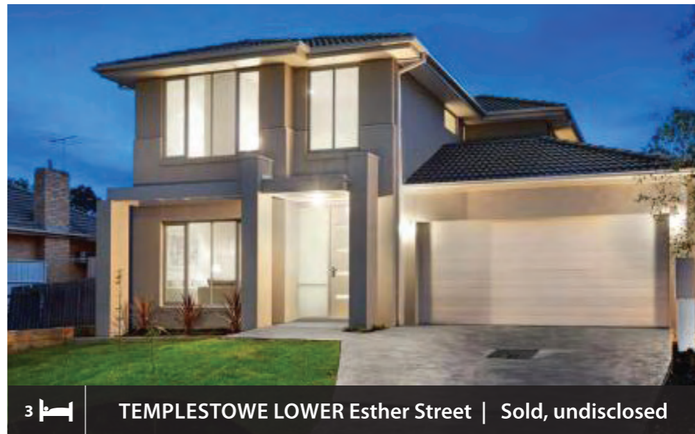
3 TEMPLESTOWE LOWER Esther Street | Sold, undisclosed