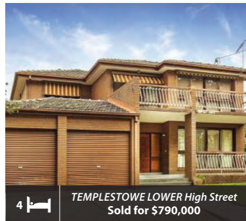
4 TEMPLESTOWE LOWER High Street Sold for $790,000