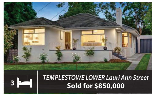
3 TEMPLESTOWE LOWER Lauri Ann Street Sold for $850,000