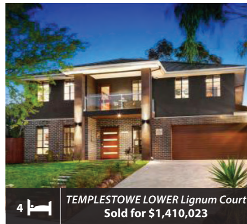
4 TEMPLESTOWE LOWER Lignum Court Sold for $1,410,023