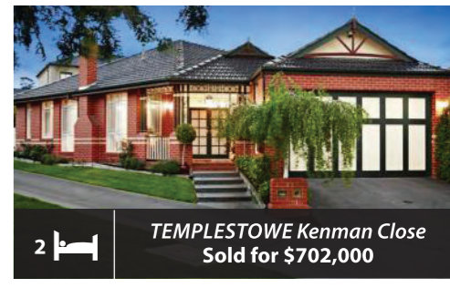
2 TEMPLESTOWE Kenman Close Sold for $702,000