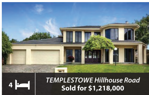
4 TEMPLESTOWE Hillhouse Road Sold for $1,218,000