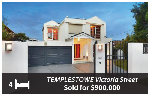
4 TEMPLESTOWE Victoria Street Sold for $900,000