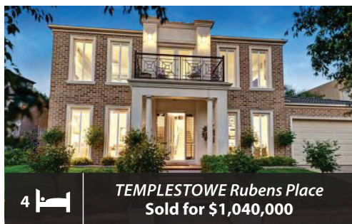
4 TEMPLESTOWE Rubens Place Sold for $1,040,000