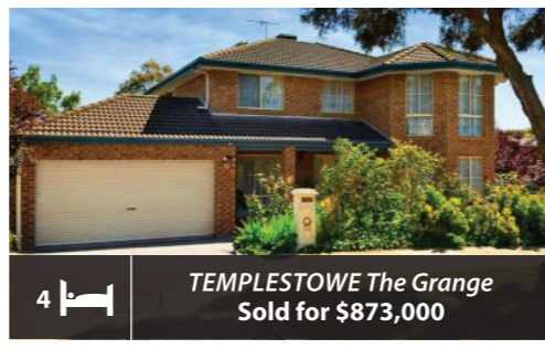
4 TEMPLESTOWE The Grange Sold for $873,000