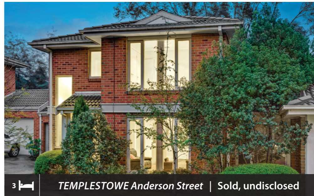
3 TEMPLESTOWE Anderson Street | Sold, undisclosed