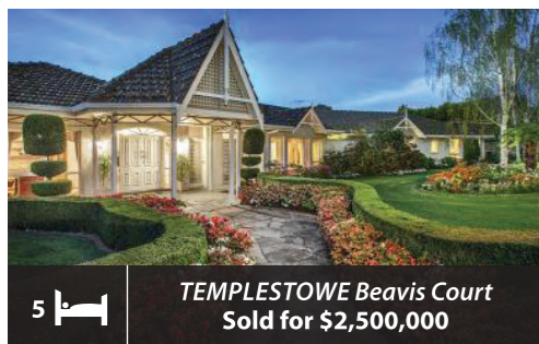
5 TEMPLESTOWE Beavis Court Sold for $2,500,000