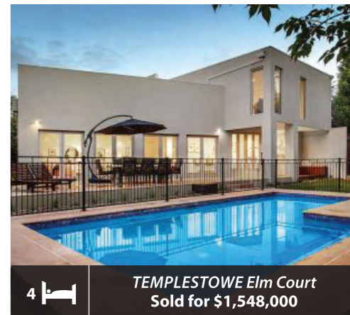
4 TEMPLESTOWE Elm Court Sold for $1,548,000