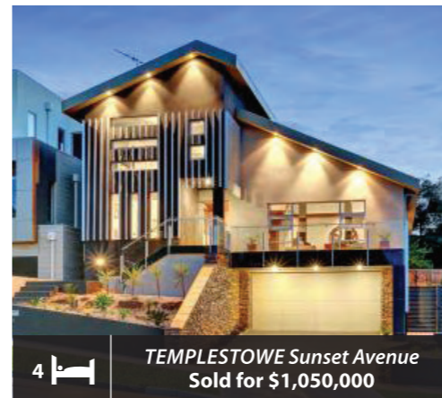
4 TEMPLESTOWE Sunset Avenue Sold for $1,050,000