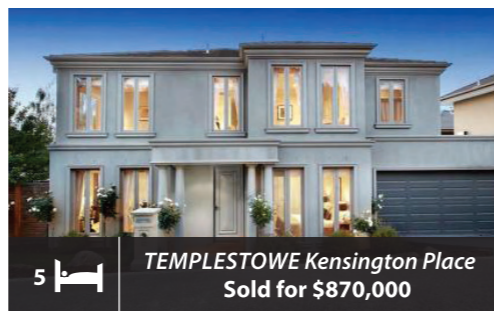
5 TEMPLESTOWE Kensington Place Sold for $870,000