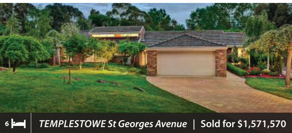
6 TEMPLESTOWE St Georges Avenue | Sold for $1,571,570