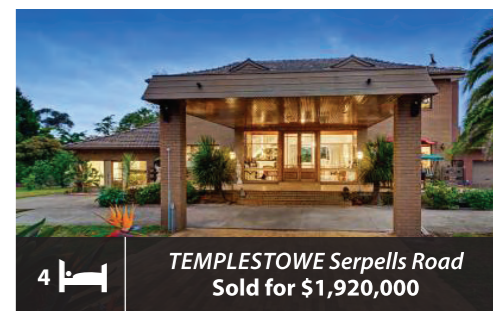
4 TEMPLESTOWE Serpells Road Sold for $1,920,000