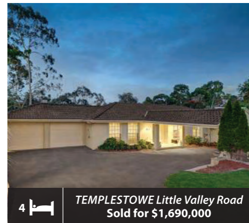
4 TEMPLESTOWE Little Valley Road Sold for $1,690,000