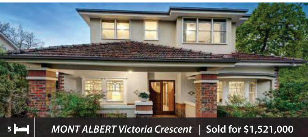
5 MONT ALBERT Victoria Crescent | Sold for $1,521,000