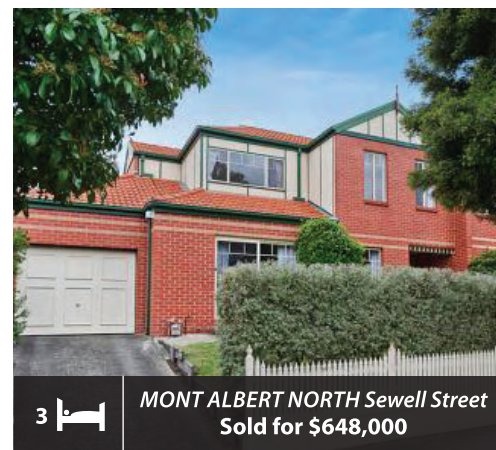
3 MONT ALBERT NORTH Sewell Street Sold for $648,000