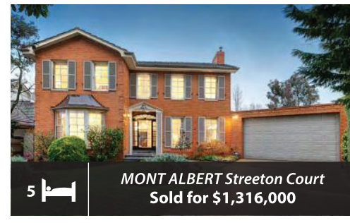
5 MONT ALBERT Streeton Court Sold for $1,316,000