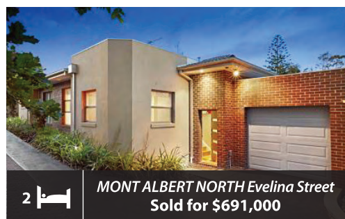
2 MONT ALBERT NORTH Evelina Street Sold for $691,000