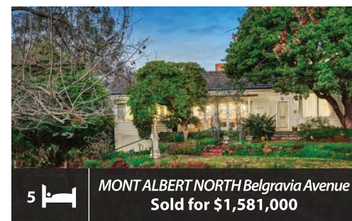
5 MONT ALBERT NORTH Belgravia Avenue Sold for $1,581,000