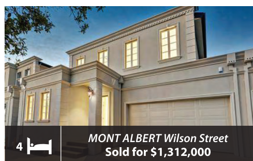
4 MONT ALBERT Wilson Street Sold for $1,312,000