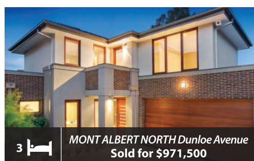
3 MONT ALBERT NORTH Dunloe Avenue Sold for $971,500