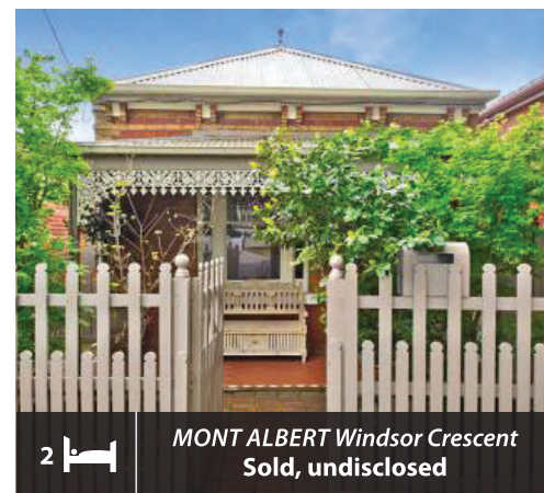
2 MONT ALBERT Windsor Crescent Sold, undisclosed