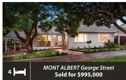
4 MONT ALBERT George Street Sold for $995,000