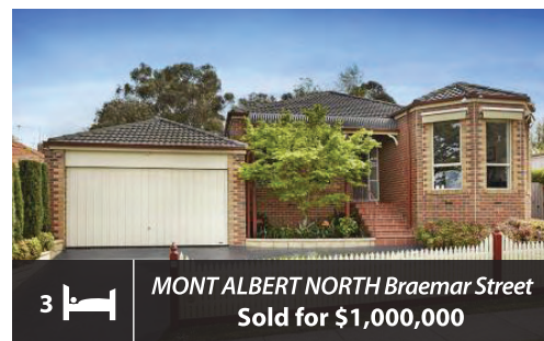
3 MONT ALBERT NORTH Braemar Street Sold for $1,000,000