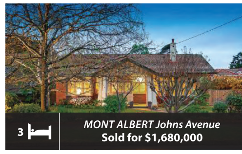
3 MONT ALBERT Johns Avenue Sold for $1,680,000