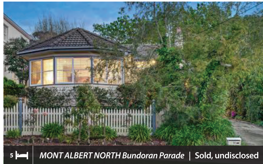
5 MONT ALBERT NORTH Bundoran Parade | Sold, undisclosed