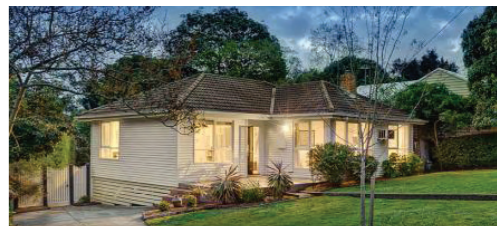
3 HEATHMONT Alvena Crescent Sold for $550,000