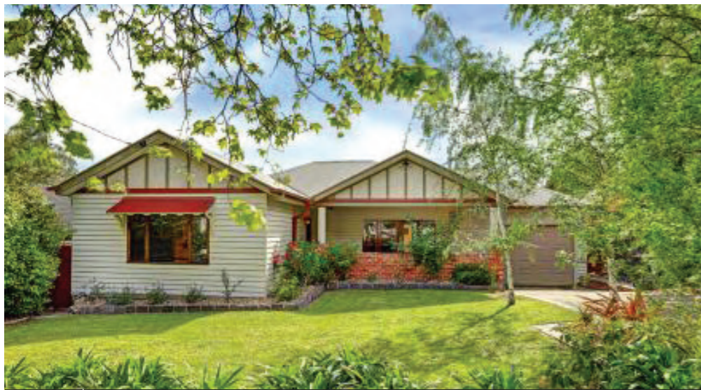
4 HEATHMONT Tagell Road | Sold for $766,000