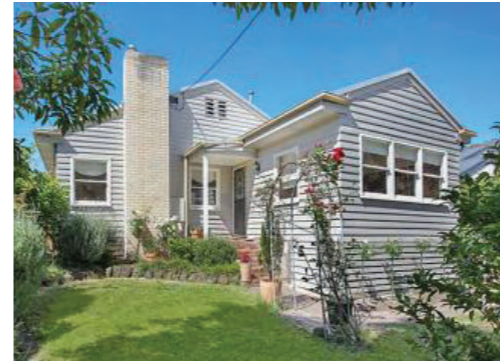
3 HEATHMONT Lisgoold Street Sold for $474,000