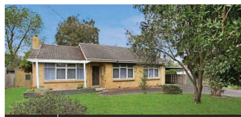
3 HEATHMONT Valerie Court Sold, undisclosed