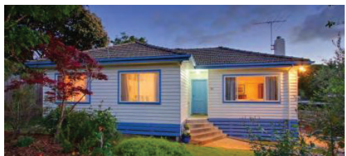
4 HEATHMONT Erica Crescent Sold, undisclosed