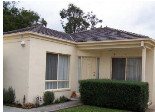
3 HEATHMONT Canterbury Road Sold for $455,000