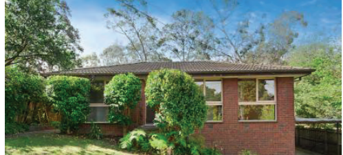
4 HEATHMONT Dirkala Avenue Sold for $570,000