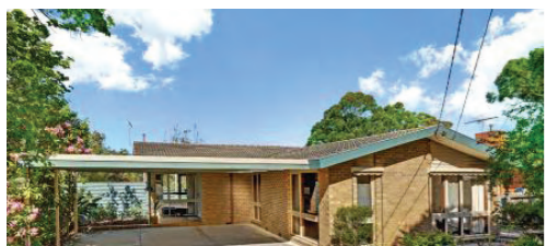
4 HEATHMONT Coven Avenue Sold for $665,000