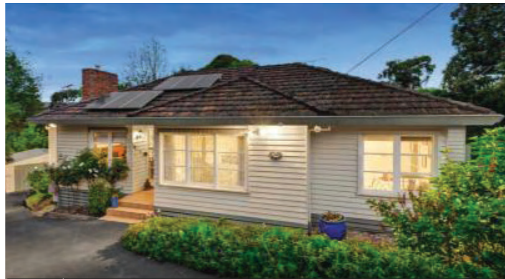
3 HEATHMONT Coven Avenue | Sold for $608,000