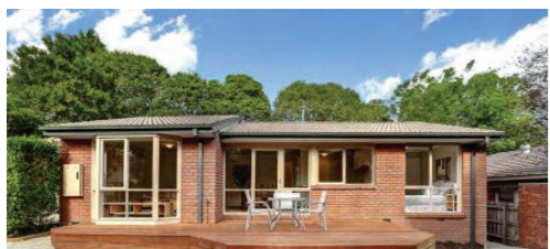
3 HEATHMONT Armstrong Road Sold for $486,500