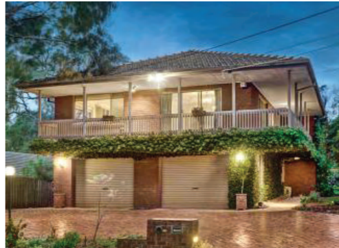
4 HEATHMONT Dirkala Avenue Sold for $720,000