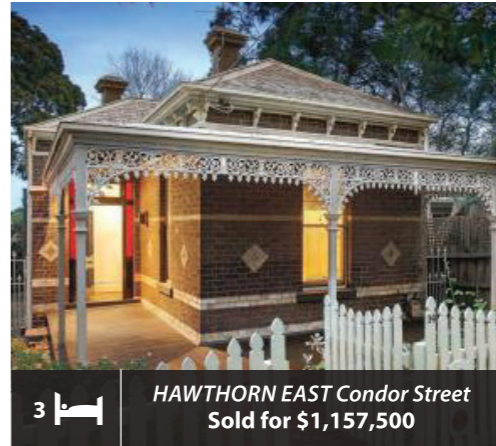
3 HAWTHORN EAST Condor Street Sold for $1,157,500