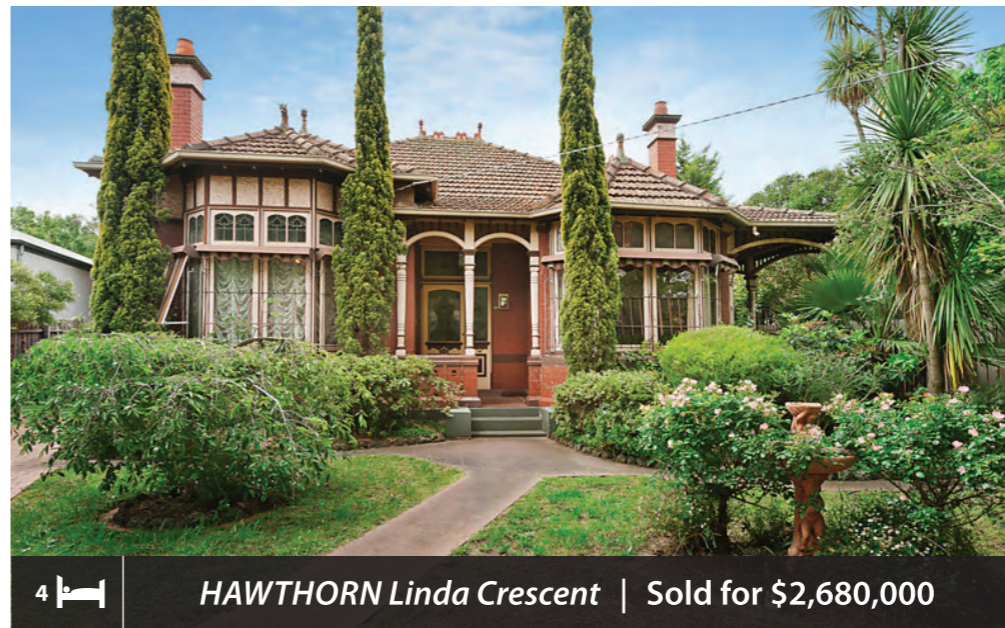
4 HAWTHORN Linda Crescent | Sold for $2,680,000