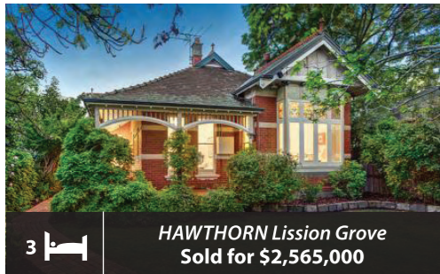
3 HAWTHORN Lission Grove Sold for $2,565,000