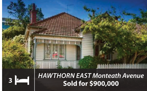
3 HAWTHORN EAST Monteath Avenue Sold for $900,000