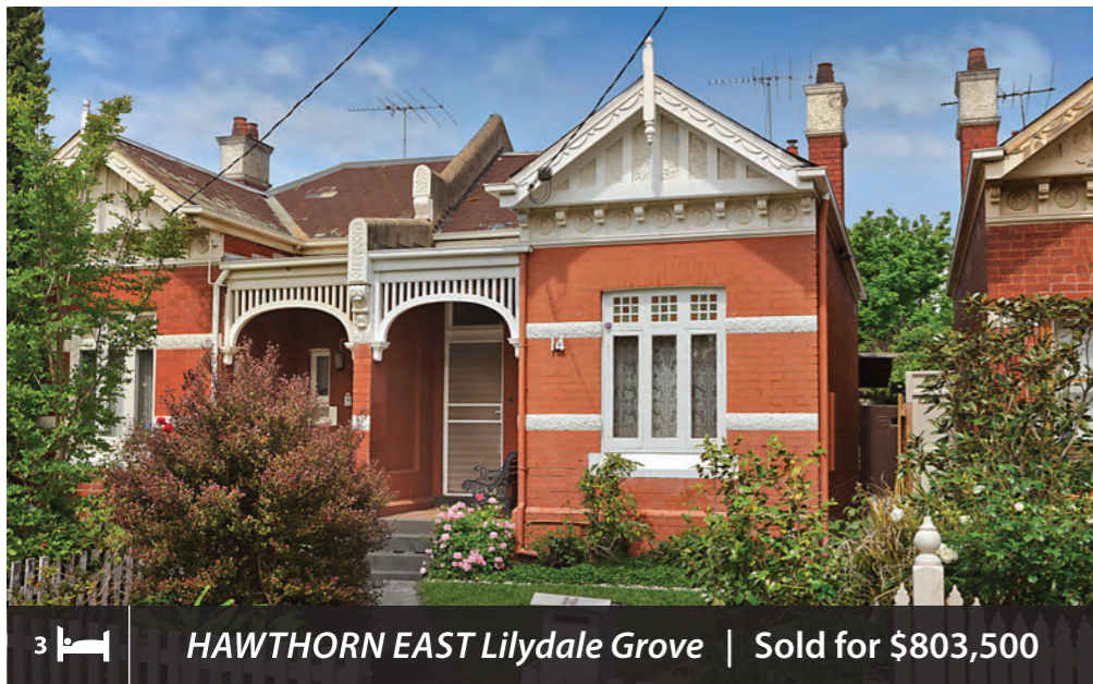
3 HAWTHORN EAST Lilydale Grove | Sold for $803,500