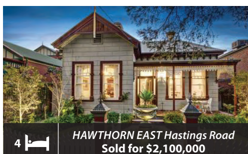
4 HAWTHORN EAST Hastings Road Sold for $2,100,000