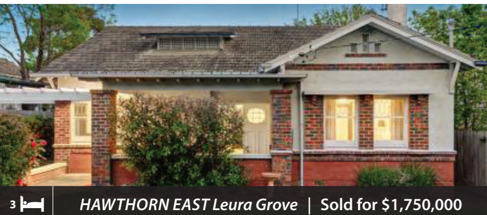
3 HAWTHORN EAST Leura Grove | Sold for $1,750,000