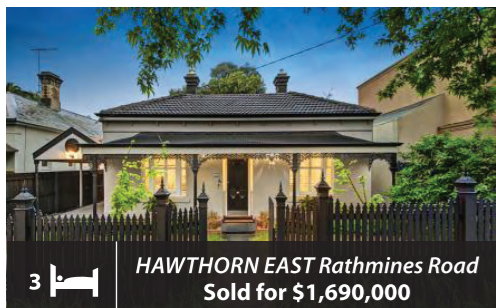
3 HAWTHORN EAST Rathmines Road Sold for $1,690,000