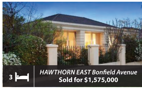
3 HAWTHORN EAST Bonfield Avenue Sold for $1,575,000