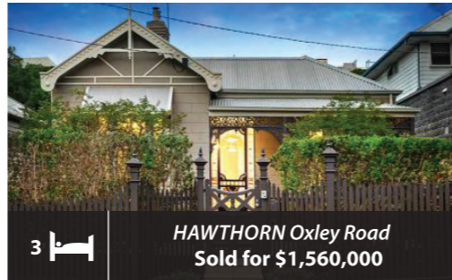
3 HAWTHORN Oxley Road Sold for $1,560,000