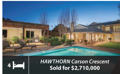
4 HAWTHORN Carson Crescent Sold for $2,710,000