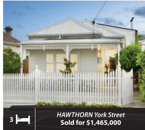
3 HAWTHORN York Street Sold for $1,465,000