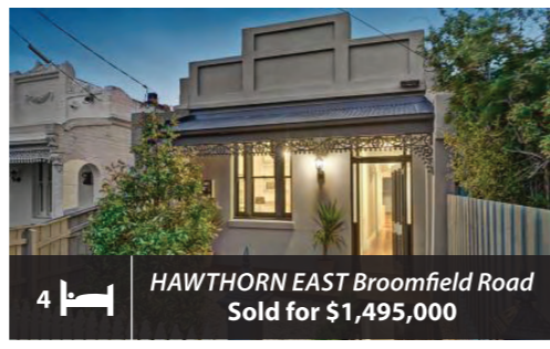
4 HAWTHORN EAST Broomfield Road Sold for $1,495,000