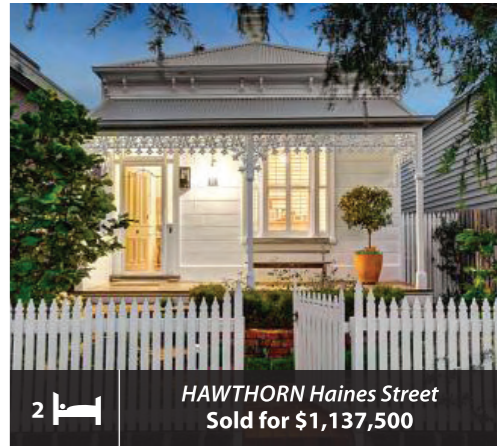
2 HAWTHORN Haines Street Sold for $1,137,500