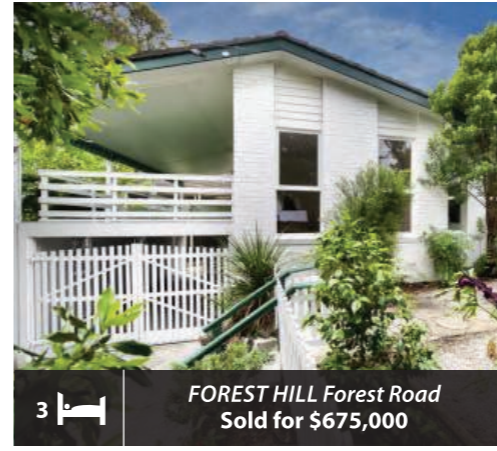
3 FOREST HILL Forest Road Sold for $675,000