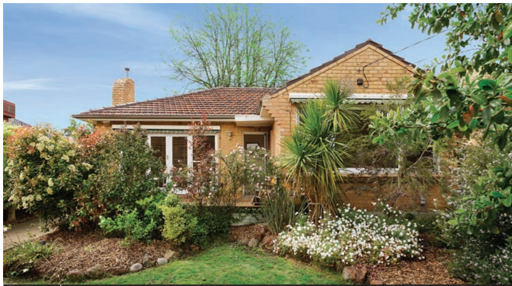
3 FOREST HILL Romoly Drive | Sold for $625,000