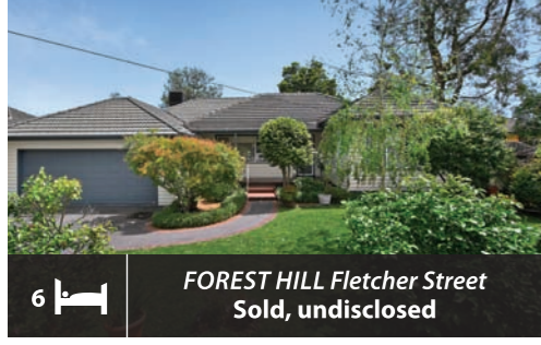
6 FOREST HILL Fletcher Street Sold, undisclosed