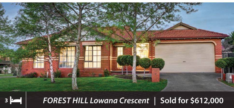
3 FOREST HILL Lowana Crescent | Sold for $612,000

“This three bedroom, family home attracted five bidders and sold above reserve”