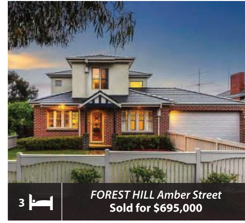
3 FOREST HILL Amber Street Sold for $695,000