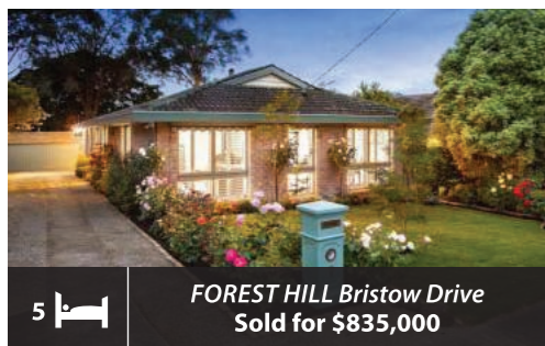
5 FOREST HILL Bristow Drive Sold for $835,000