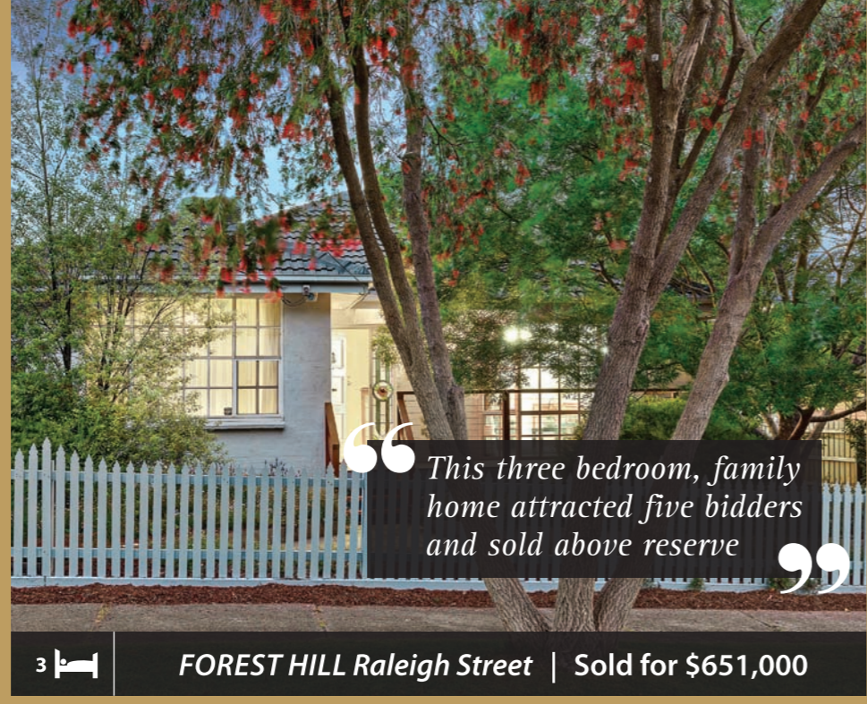
3 FOREST HILL Raleigh Street | Sold for $651,000

“This three bedroom, family home attracted five bidders and sold above reserve”