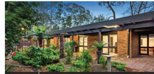
4 FOREST HILL Menin Road Sold for $822,000