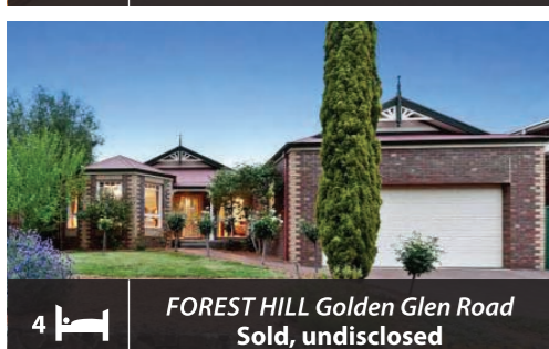
4 FOREST HILL Golden Glen Road Sold, undisclosed