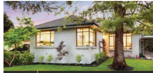
4 FOREST HILL Teal Court Sold for $791,000