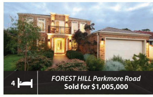
4 FOREST HILL Parkmore Road Sold for $1,005,000