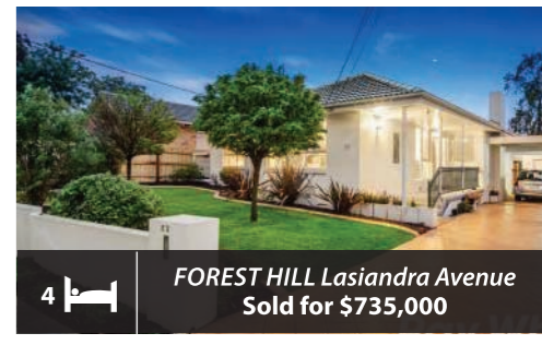
4 FOREST HILL Lasiandra Avenue Sold for $735,000