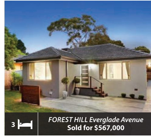
3 FOREST HILL Everglade Avenue Sold for $567,000