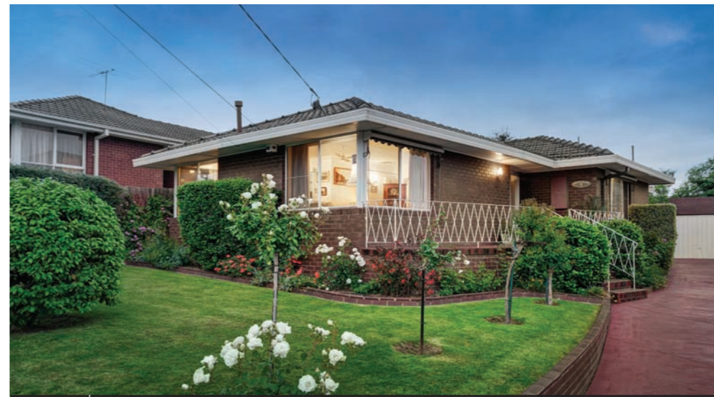
3 FOREST HILL Cumberland Court | Sold for $650,000