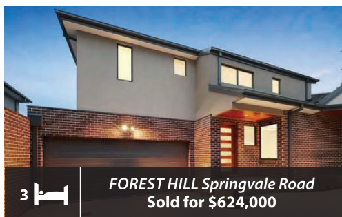
3 FOREST HILL Springvale Road Sold for $624,000