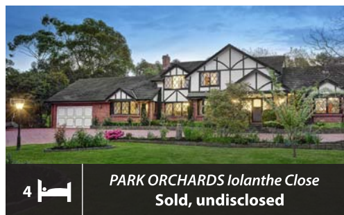
4 PARK ORCHARDS Iolanthe Close Sold, undisclosed