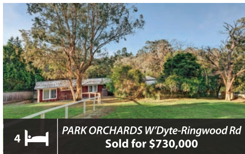
4 PARK ORCHARDS W'Dyde-Ringwood Rd Sold for $730,000