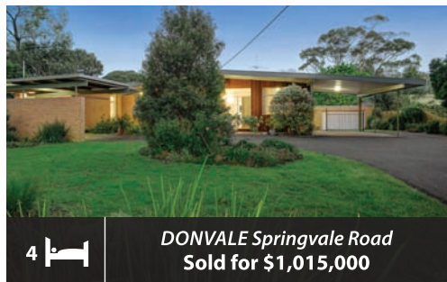
4 DONVALE Springvale Road Sold for $1,015,000