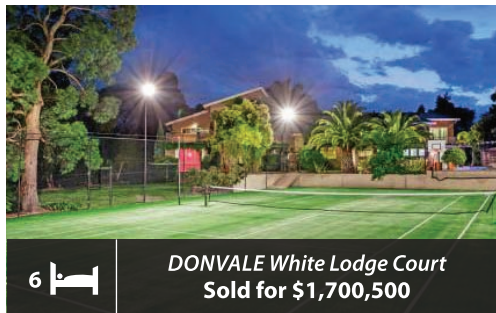
6 DONVALE White Lodge Court Sold for $1,700,500