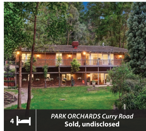
4 PARK ORCHARDS Curry Road Sold, undisclosed