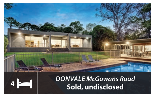
4 DONVALE McGowans Road Sold, undisclosed