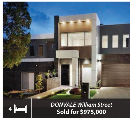
4 DONVALE William Street Sold for $975,000