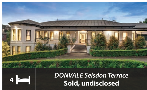
4 DONVALE Selsdon Terrace Sold, undisclosed