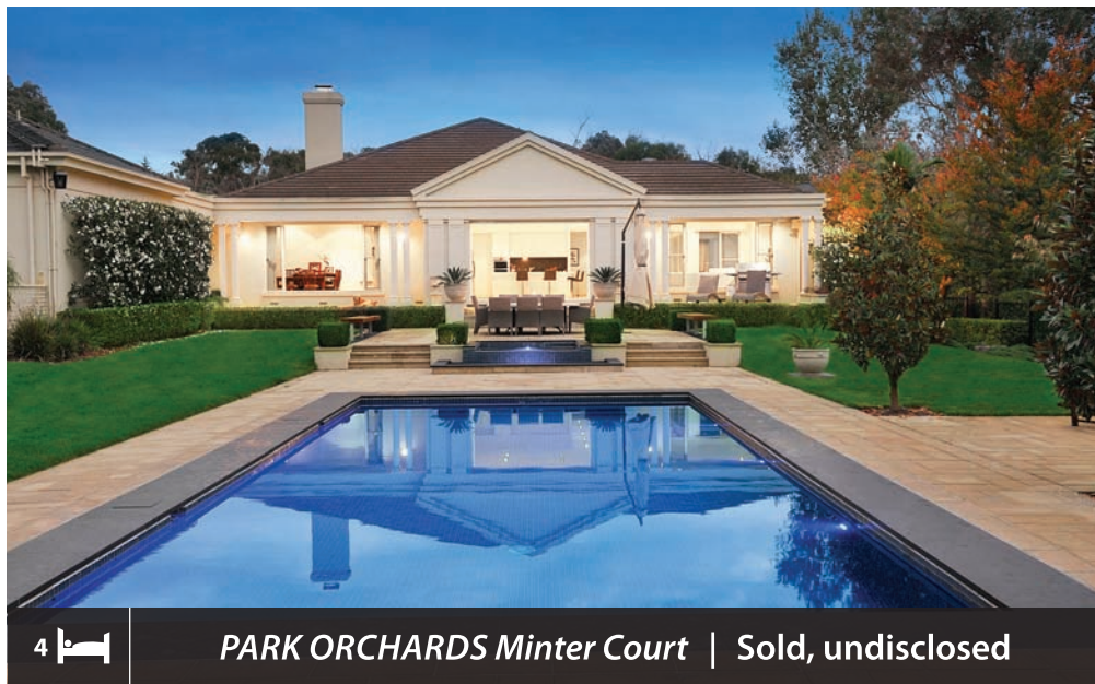
4 PARK ORCHARDS Minter Court | Sold, undisclosed