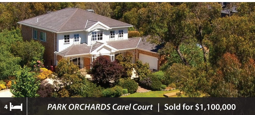
4 PARK ORCHARDS Carel Court | Sold for $1,100,000