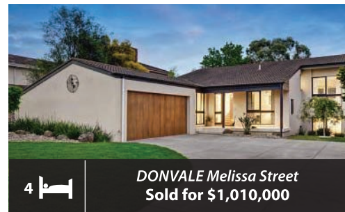
4 DONVALE Melissa Street Sold for $1,010,000