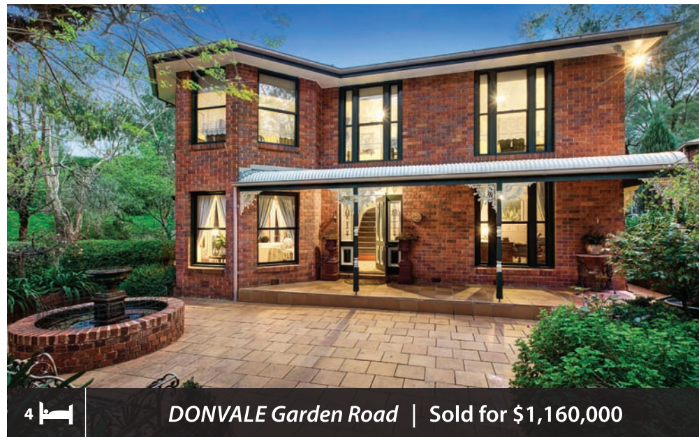
4 DONVALE Garden Road | Sold for $1,160,000