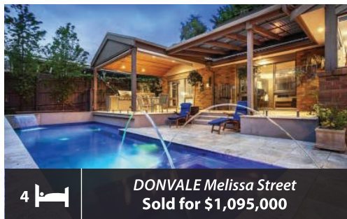
4 DONVALE Melissa Street Sold for $1,095,000