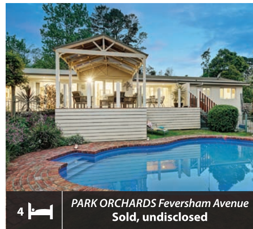
4 PARK ORCHARDS Feversham Avenue Sold, undisclosed