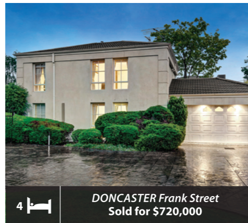
4 DONCASTER Frank Street Sold for $720,000