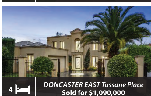
4 DONCASTER EAST Tussane Place Sold for $1,090,000