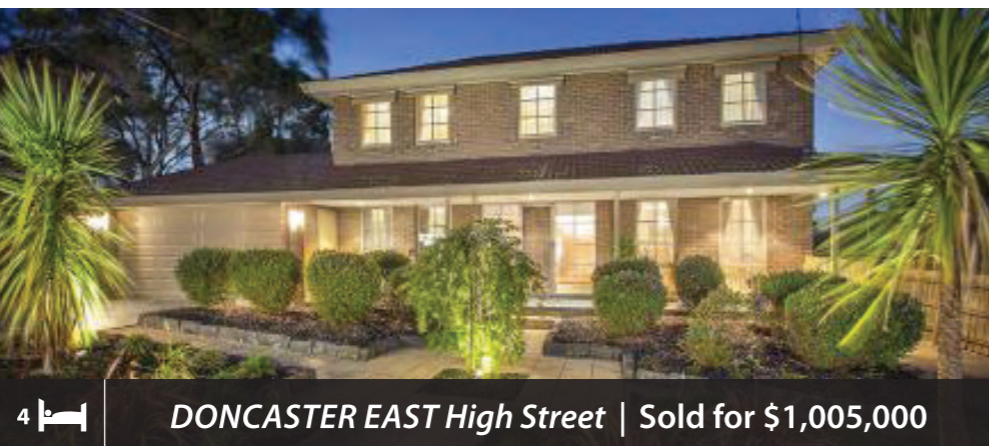
4 DONCASTER EAST High Street | Sold for $1,005,000