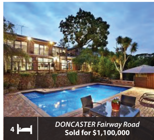
4 DONCASTER Fairway Road Sold for $1,100,000