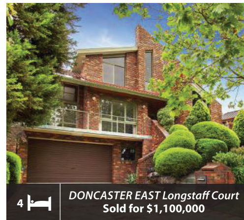
4 DONCASTER EAST Longstaff Court Sold for $1,100,000