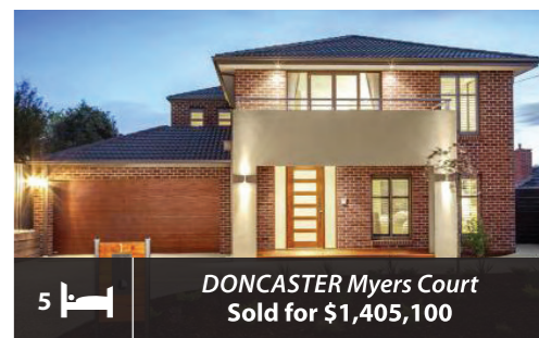
5 DONCASTER Myers Court Sold for $1,405,100