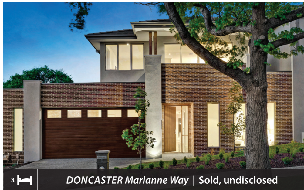
3 DONCASTER Marianne Way | Sold, undisclosed