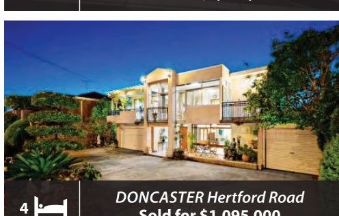
4 DONCASTER Hertford Road Sold for $1,095,000