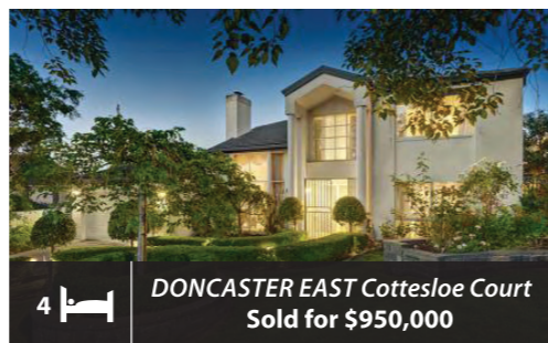
4 DONCASTER EAST Cottesloe Court Sold for $950,000