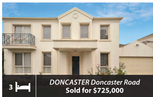
3 DONCASTER Doncaster Road Sold for $725,000