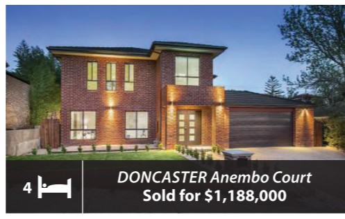
4 DONCASTER Anembo Court Sold for $1,188,000