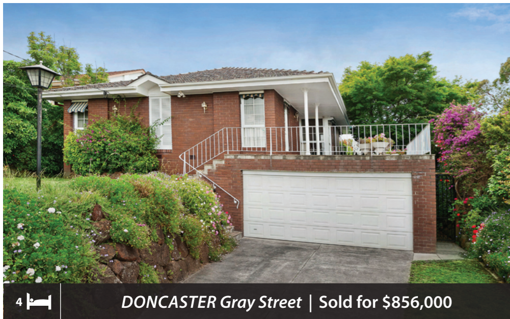
4 DONCASTER Gray Street | Sold for $856,000