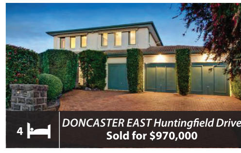
4 DONCASTER EAST Huntingfield Drive Sold for $970,000