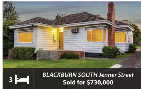
3 BLACKBURN SOUTH Jenner Street Sold for $730,000