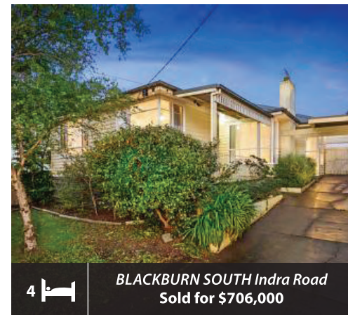
4 BLACKBURN SOUTH Indra Road Sold for $706,000