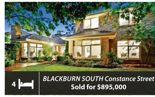
4 BLACKBURN SOUTH Constance Street Sold for $895,000