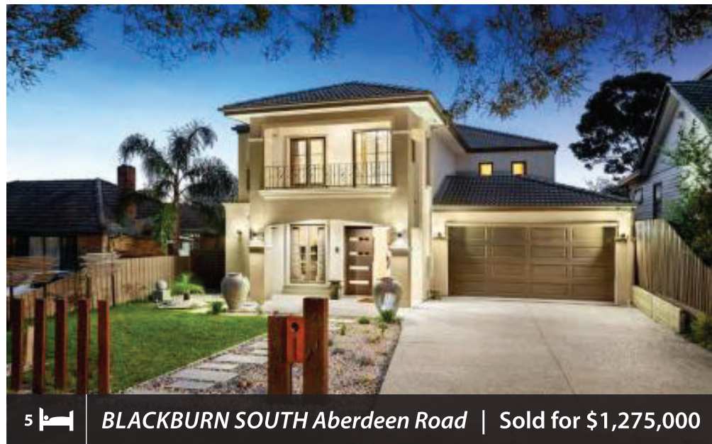
5 BLACKBURN SOUTH Aberdeen Road | Sold for $1,275,000