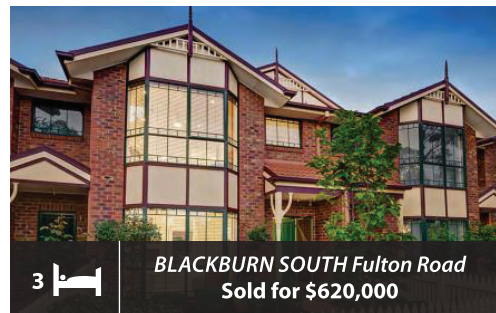
3 BLACKBURN SOUTH Fulton Road Sold for $620,000