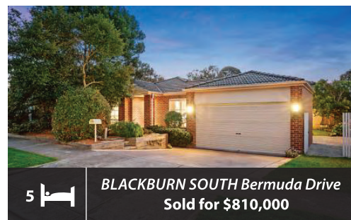
5 BLACKBURN SOUTH Bermuda Drive Sold for $810,000