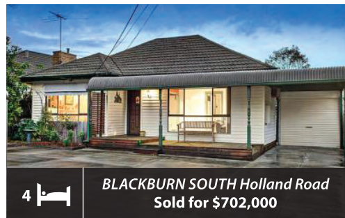
4 BLACKBURN SOUTH Holland Road Sold for $702,000