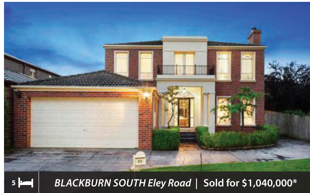
5 BLACKBURN SOUTH Eley Road | Sold for $1,040,000*