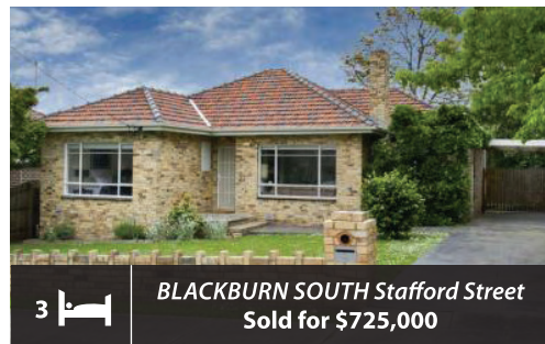
3 BLACKBURN SOUTH Stafford Street Sold for $725,000