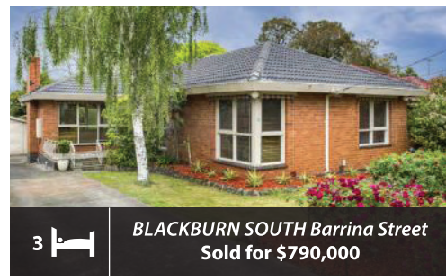
3 BLACKBURN SOUTH Barrina Street Sold for $790,000