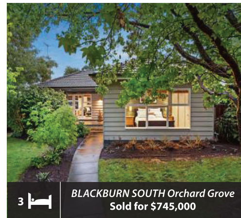
3 BLACKBURN SOUTH Orchard Grove Sold for $745,000