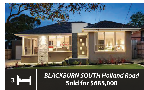
3 BLACKBURN SOUTH Holland Road Sold for $685,000