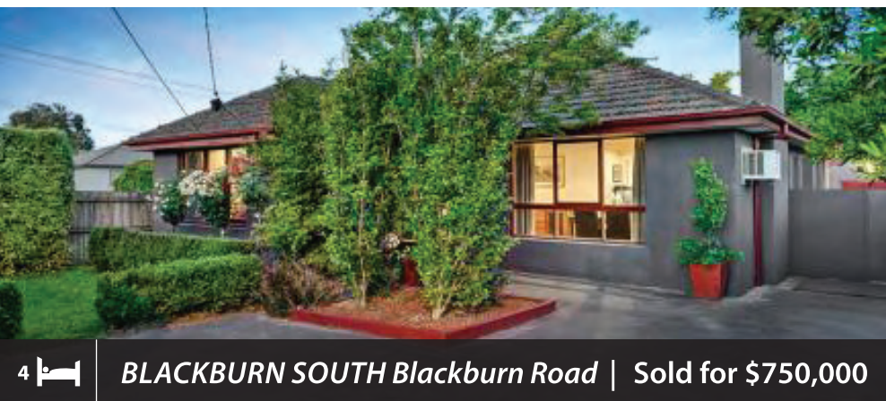
4 BLACKBURN SOUTH Blackburn Road | Sold for $750,000