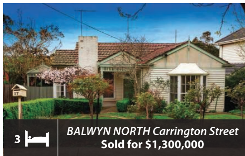
3 BALWYN NORTH Carrington Street Sold for $1,300,000