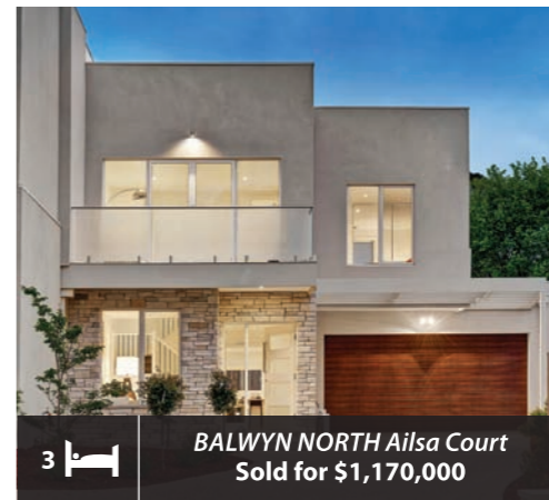
3 BALWYN NORTH Ailsa Court Sold for $1,170,000