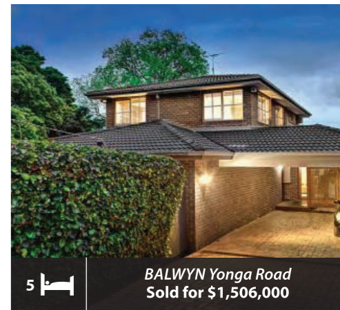
5 BALWYN Yonga Road Sold for $1,506,000