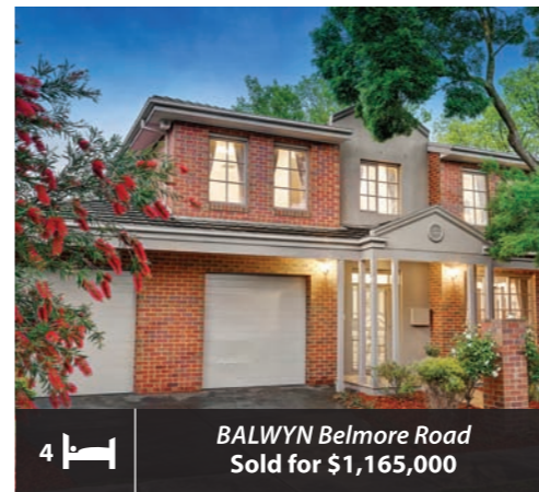
4 BALWYN Belmore Road Sold for $1,165,000