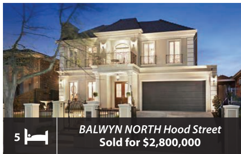
5 BALWYN NORTH Hood Street Sold for $2,800,000