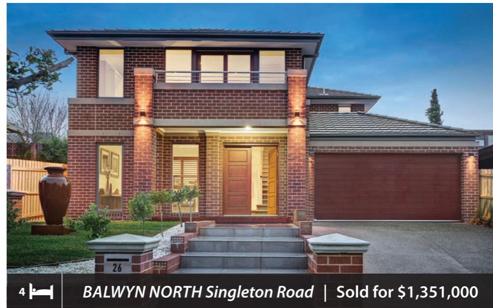
4 BALWYN NORTH Singleton Road | Sold for $1,351,000