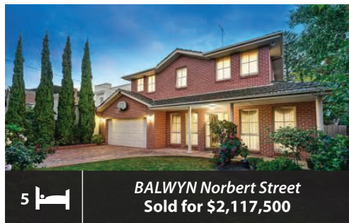
5 BALWYN Norbert Street Sold for $2,117,500