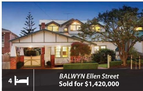
4 BALWYN Ellen Street Sold for $1,420,000