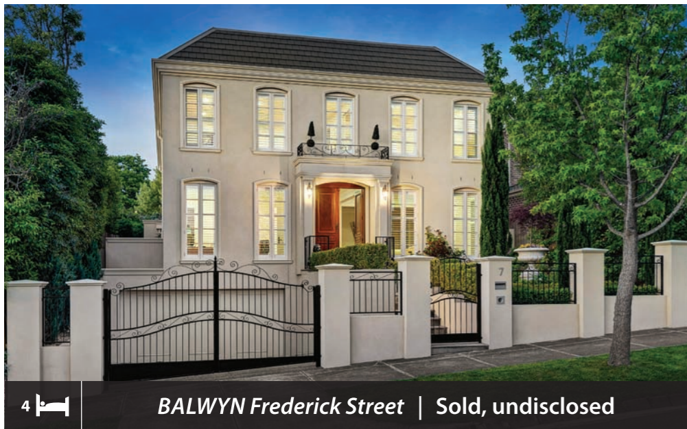
4 BALWYN Frederick Street | Sold, undisclosed