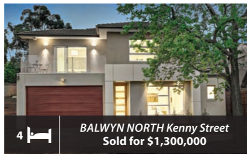
4 BALWYN NORTH Kenny Street Sold for $1,300,000