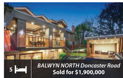
5 BALWYN NORTH Doncaster Road Sold for $1,900,000