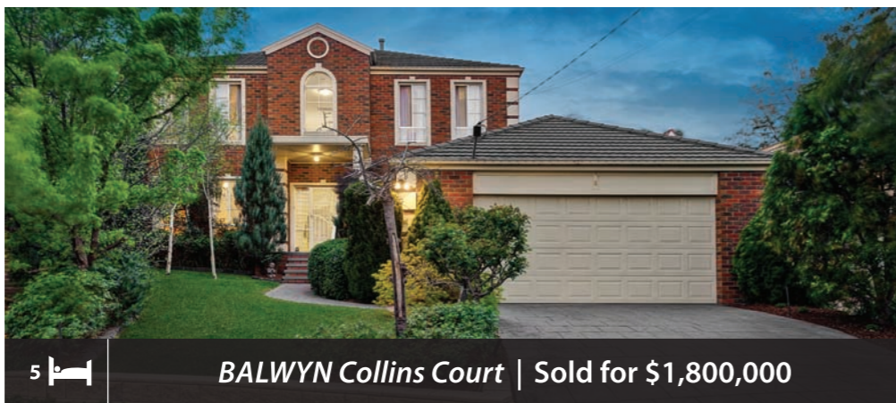
5 BALWYN Collins Court | Sold for $1,800,000