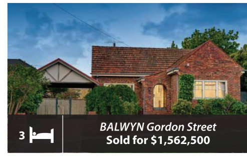
3 BALWYN Gordon Street Sold for $1,562,500