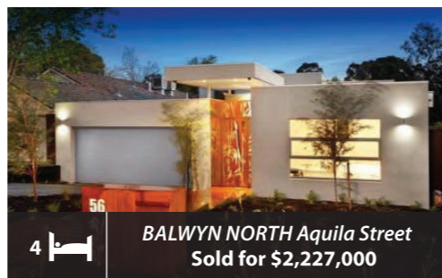
4 BALWYN NORTH Aquila Street Sold for $2,227,000