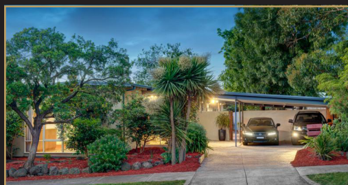
MITCHAM Mountfield Road SOLD $575,000