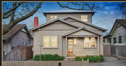
MITCHAM Fellows Road SOLD $805,000