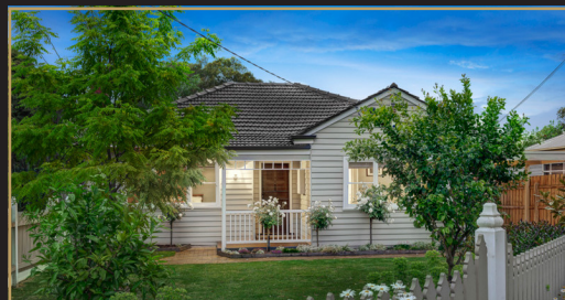
MITCHAM Alwyn Court SOLD $615,000