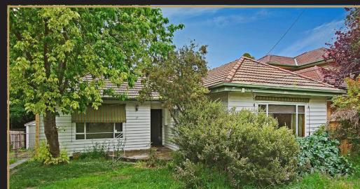
MITCHAM Reserve Avenue SOLD $520,000