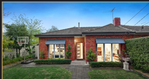
MITCHAM Fellows Road SOLD $565,000