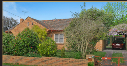
MITCHAM Haines Street SOLD $