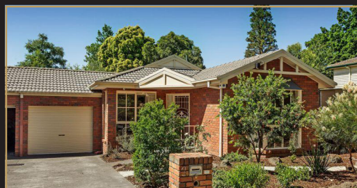
MITCHAM Meerut Street SOLD $507,000