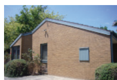
Wattle Valley Road