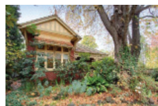
Wattle Valley Road