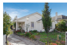
Mont Albert Road